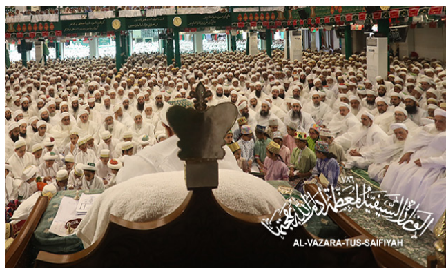
Al-Dai al-Ajal Syedna Mufaddal Saifuddin (RUS) delivering Ashara Mubarakah Waaz 1439H

This fundamental belief of ‘unity’ or ‘social solidarity’ forms the very bedrock upon which our community has been founded. Imagine: that in the face of difficulty, all our ancestors had to keep standing was the support of a brother's shoulder locked with their own. That in times of