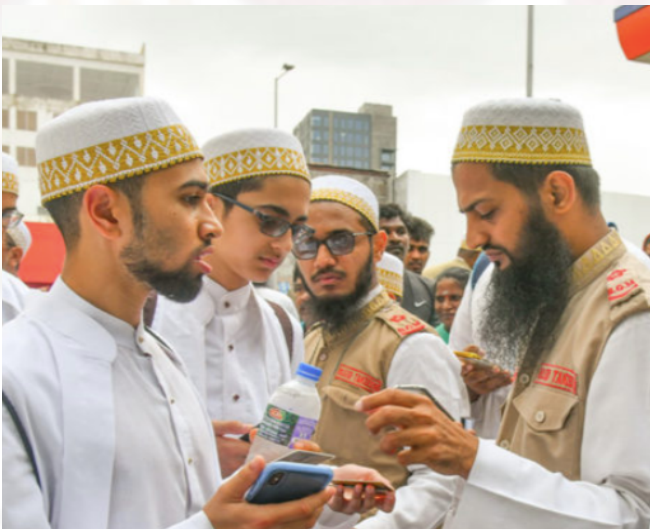
Mumineen performing Khidmat during Ashara Mubarakah 1441H

These are not just remnants of ancient history, nor echoes of a faraway past. The legends of yore live strong today in the spirit of community and service that we all share. Even today we work, grow, and live as one. Hundreds of Mumineen dedicate their time, energy, and resources for the ‘ Jama’at ’. This devotion and service is what we proudly refer to as ‘ Khidmat of Moulana ’. These ideals of camaraderie and brotherhood have not only been passed down to us as inheritance by our forefathers, but have also been inducted in the very fabric of our identity by the Duat Mutleqeen RA . For centuries, our Mawali Kiraam AS have taught us these principles. From Amirul Mumineen AS carrying water for a widow - to Imam Husain AS breaking off his Tawaaf for the sake of a Mumin - our Hudood AS have shaped us in every way to care for each other and achieve success not individually, but as a community. Today, it can undoubtedly be said that these ideals have been etched into our hearts by Syedna Mohammed Burhanuddin RA . Furthering this lofty cause, his successor Syedna Mufaddal Saifuddin Aqa TUS in his great foresight has accommodated and divided these ideals of community service and Khidmat into 12 Umoor.