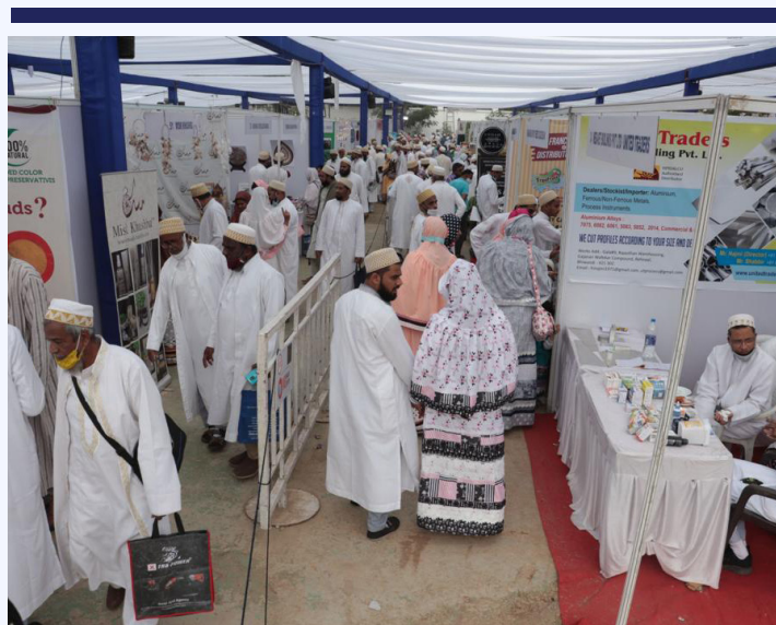
Saifee Burhani Expo 2021, Taherabad

This concept of ‘collective growth’ in business has been exemplified by Awliya Allah AS throughout history. Dating back to the time of RasulAllah’s SAW ancestors,